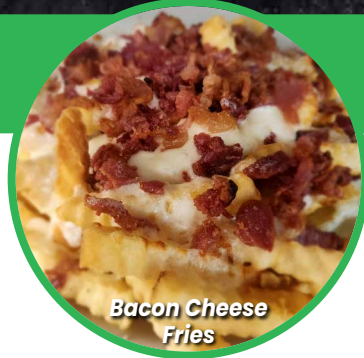
Bacon Cheese Fries

Premium, crinkle-cut French fries. Small - 5.50 Large - 6.75