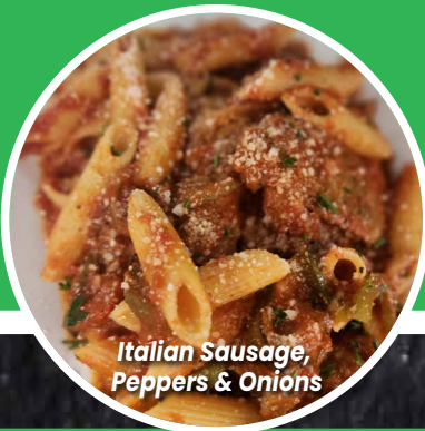
Italian Sausage, Peppers & Onions