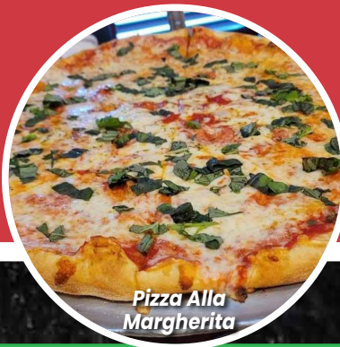
Pizza Alla Margherita