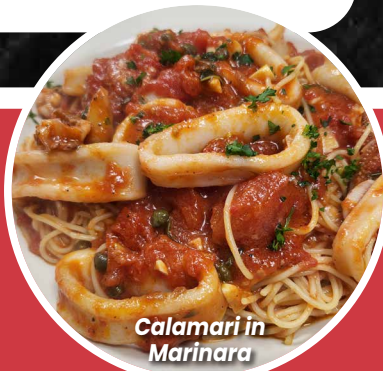
Calamari in Marinara