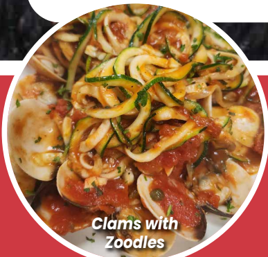
Clams with Zoodles

Jumbo shrimp sautéed with cherry peppers and onion in our homemade marinara sauce - 17.99