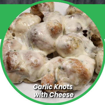
Garlic Knots with Cheese