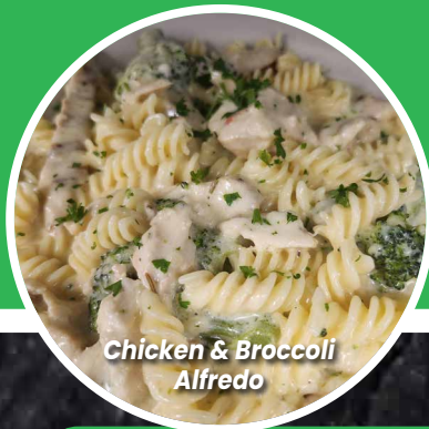
Chicken & Broccoli Alfredo