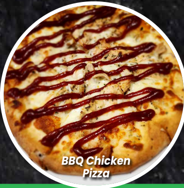
BBQ Chicken Pizza