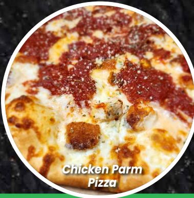
Chicken Parm Pizza