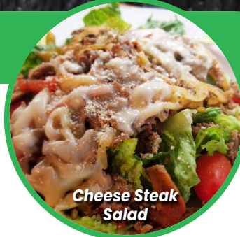
Cheese Steak Salad

Sautéed scampi-style shrimp atop crisp romaine with tomatoes, cucumber, onions, Kalamata olives, roasted red peppers, artichoke hearts and fresh mushrooms - 13.99