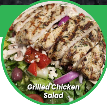
Grilled Chicken Salad